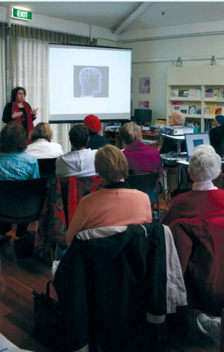
What's On information session.