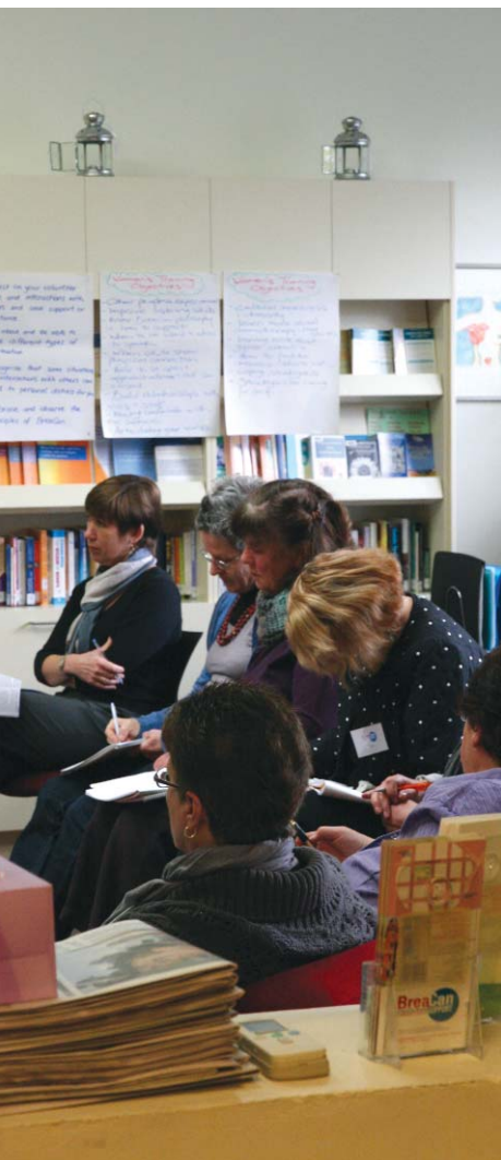
The fifth intake of peer support volunteers begin their training.