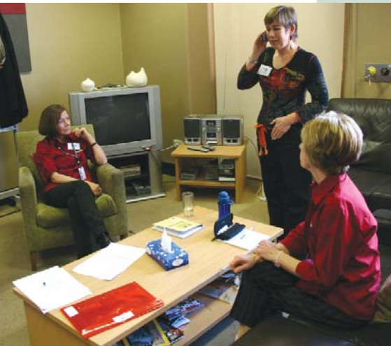
BreaCan staff and volunteers in the Cancer Resource Room at the Royal Melbourne Hospital, where they provide the Bridge of Support program.

The training program commenced in June 2011 with eight days of training over an eight week period. Often not all the women who commence training will go on to become peer support volunteers. For those who do, a formal program of orientation and induction into the service is completed before commencing work as peer support volunteers.