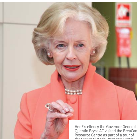
Her Excellency the Governor General Quentin Bryce AC visited the BreaCan Resource Centre as part of a tour of the Queen Victoria Women's Centre.