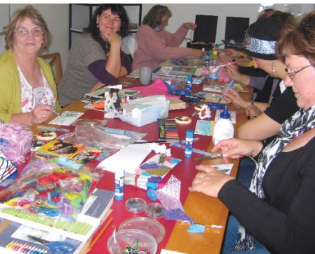
Women enjoy one of the creative concurrent sessions at the Altona forum.

In 2010/2011 BreaCan ran five Making Connections sessions including: Breast cancer and bones – issues, treatment and the future; National research into the needs of women living with advanced breast cancer – survey results; Talking about difficult issues; Coffee, cup cakes and connections; and The emotional impact of a diagnosis of advanced cancer.