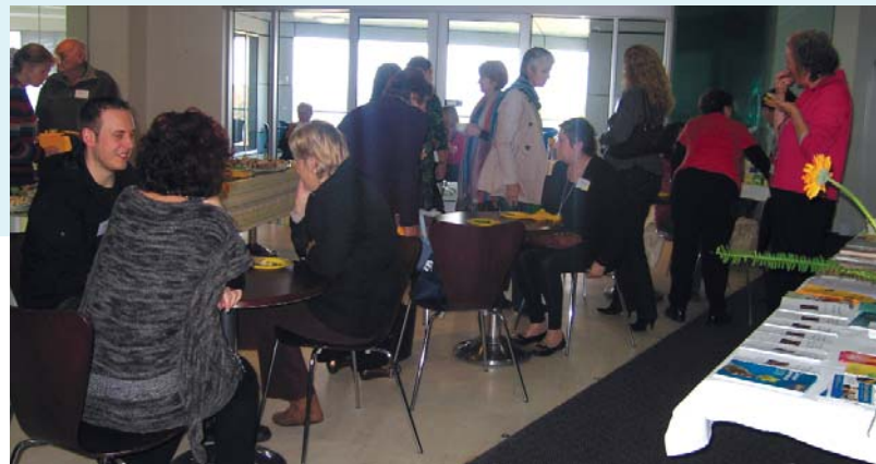
Mercy Hospital for Women gynaecological cancer forum.