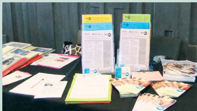
BreaCan display promotional materials at the BCNA Sale Living well beyond breast cancer forum.