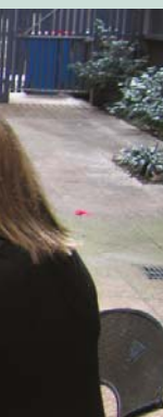
‘Hope in the face of uncertainty’ – Information forum for women living with advanced cancer.

As a result of Expressions of Interest received, two group visits and two regional forums are being planned for the second half of 2011. BreaCan will offer this program again in 2011/2012.